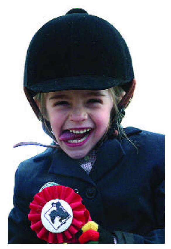
Wear a helmet

Keep yourself safe while horseback riding.